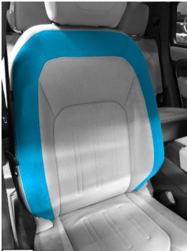
Front backrest cover.