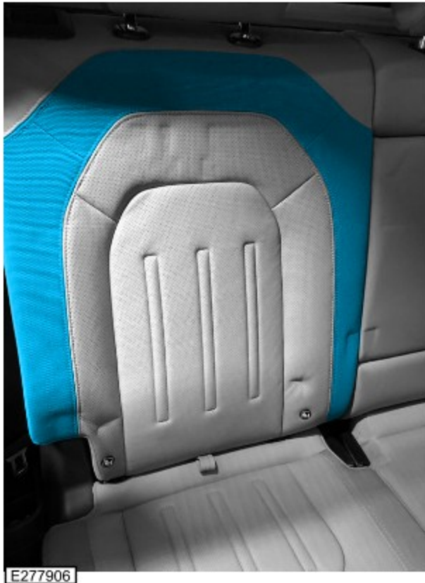
Second row backrest cover.