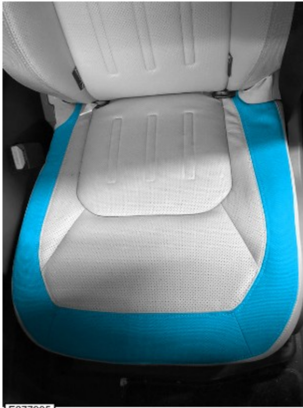
Front cushion cover.