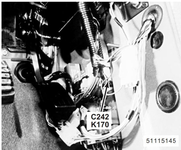
175. behind RH footwell trim panel (MFI-V8 shown; others similar) K170 A/C Logic Relay C242 (5-Y)