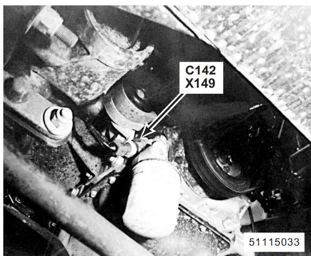
47. lower RH side of engine (MFI-T16) X149 Oil Pressure Switch C142 (2-N)