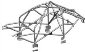
NEW: BMW E46 Full Weld In Cage