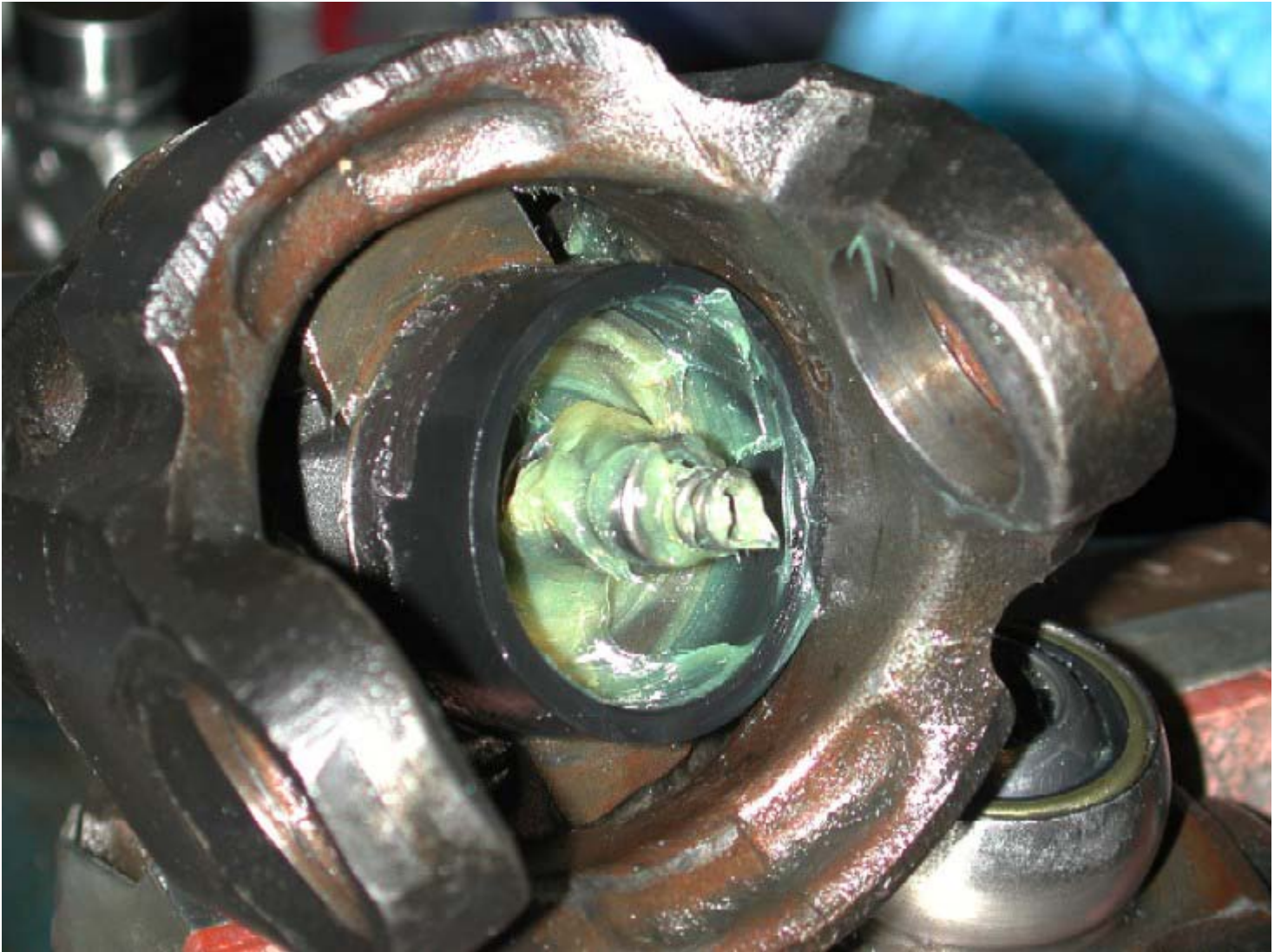
Here is the new bearing, it comes with a new dust seal and also a spring for the end of the shaft. It comes with a small cardboard tube inside it to keep all the needle rollers in place.