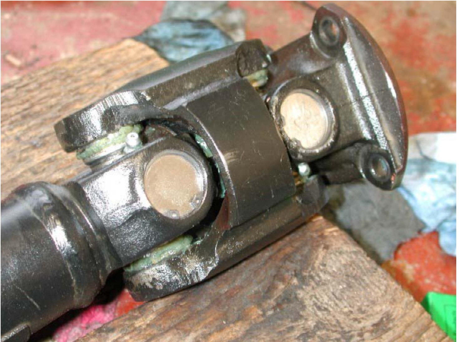
Shaft fully rebuilt again with new centering bearing, re-greased and ready for fitment back to the car.

Propshaft UJ's ----- Neapco 1-0005, Precision 344 Centering bearing ----Neapco 7-0081NG, Precision 617