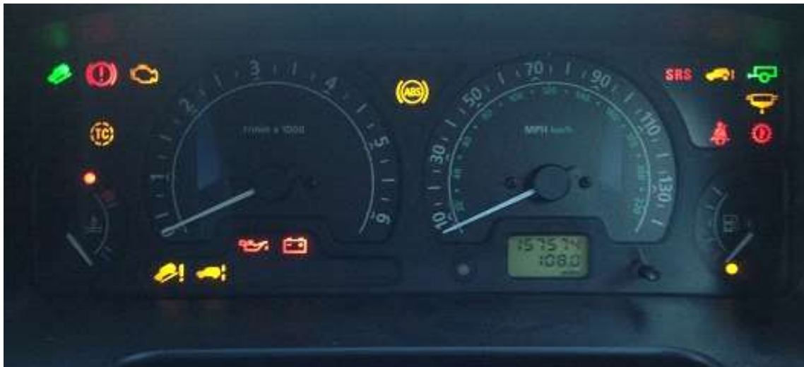
This Photo is from a 2003 TD5 D2 Manual, with SLS , without ACE. At just ignition switched on position.

General condition of tyres including inside walls.