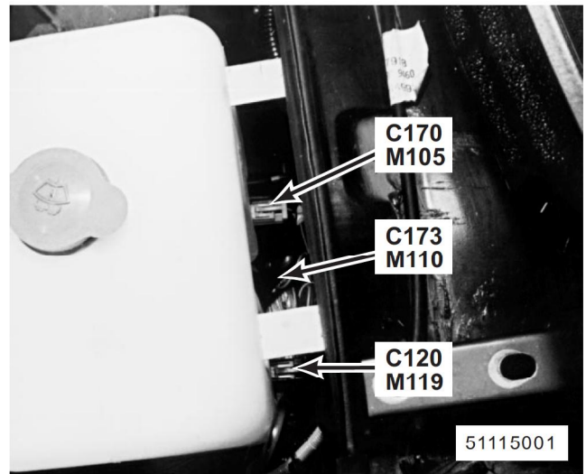
2. LH rear corner of engine compartment M105 Front Screen Wash Pump M110 Headlamp Wash Pump M119 Rear Screen Wash Pump C120 (2-W) C170 (2-R) C173 (2-B)