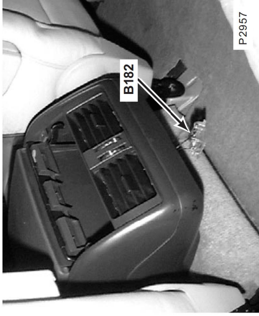
203. in centre console rear of B182 Rear Footwell Lamp